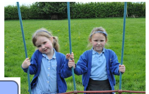
JOY 'A happy heart makes the face cheerful.' Proverbs 15:13