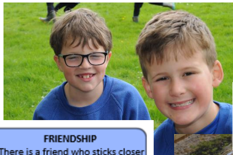
FRIENDSHIP 'There is a friend who sticks closer than a brother.' Proverbs 18:24