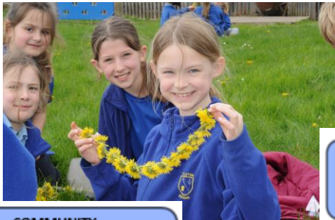
COMMUNITY How good and pleasant it is when God's people live together in unity.' Psalm 133.1

Last week we had Tempest Photography in school taking photographs to update our values pictures in the main entrance. Below are the ones we have chosen to show our values in action.