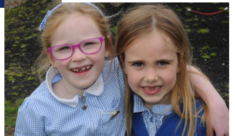
TRUST 'May the God of hope fill you with all joy and peace as we trust in him.' Romans 15:13