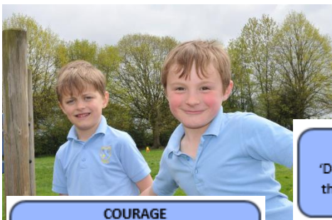
COURAGE 'Be strong and courageous, do not be frightened or dismayed, for the Lord your God is with you wherever you go.' Joshua 1:9