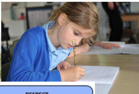
RESPECT 'Do to others as you would have them do to you.' Matthew 7:12