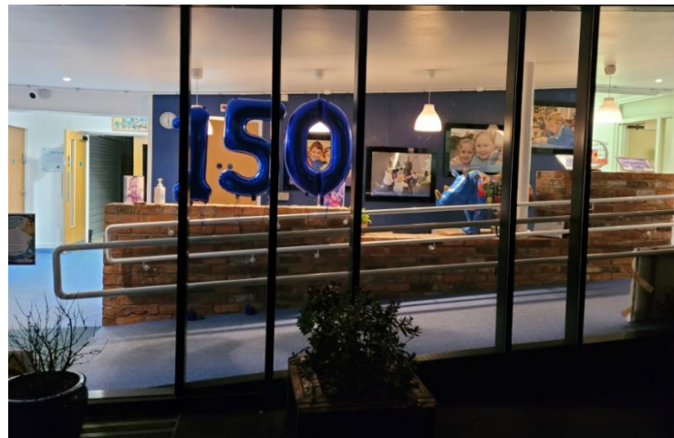
We enjoyed celebrating our birthday together!