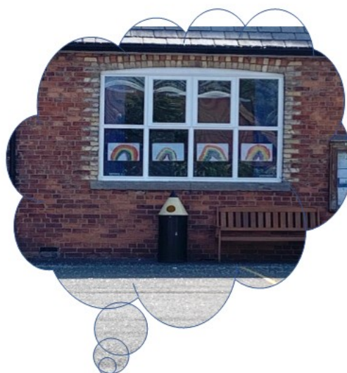
Tilston Primary School

What a fantastic job they have all done! It would be great to feature some more pictures next week, so if you would like to be included please email photos to claireblake1@live.co.uk